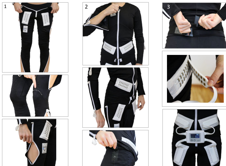
Fig. 1 Donning of the Mollii® suit – trousers [1] and jacket [2] and connection of the control unit to the suit [3]

Characteristics were collected in terms of age, sex, diagnosis, paretic side, time to inclusion from stroke onset and independence in walking with the Functional Ambulation Categories [19] as well as independence in self-care and mobility by use of the Barthel Index [22].